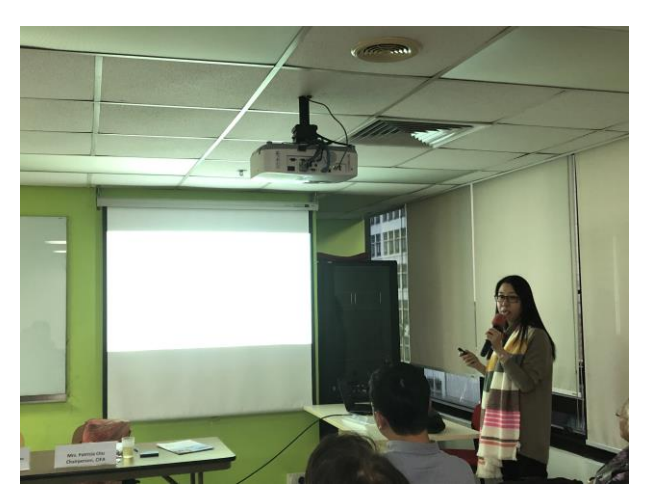
Representative from AKA shared her experience at the Launching Ceremony of Wofoo 3A Project 2020

The Final Adjudication and Award Presentation Ceremony of all the previous 3A Projects have always been a highlight of CIFA Regional Symposiums. However, as mentioned above, due to the COVID-19 outbreak, the CIFA Council has been watching the development and will decide in August 2020 whether the 6<sup>th</sup> Regional Symposium be continued as originally planned in November 2020, or rescheduled to 2021. Any change of the timing of the Symposium will affect the adjudication process of the Wofoo 3A Project 2020. An announcement on this arrangement has been made to inform all concerned parties.