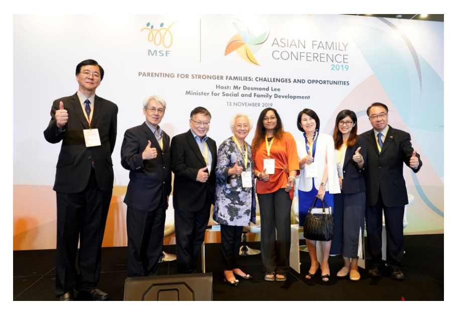
Council members and representatives from NTU Children and Family Research Centre at the 2<sup>nd</sup> Asian Family Conference