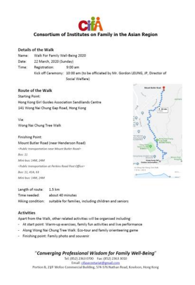
Information sheet on the Walk for Family Well-Being